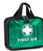
200 Pieces First Aid Kit