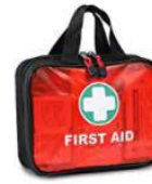
200 Pieces First Aid Kit